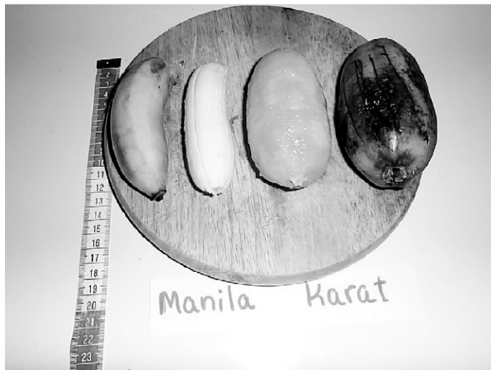
Photo 1. Ripe raw banana, uht en yap (top left), usr kufafa (top right), uht manila (lower left), and uht Karat (lower right) showing color differences of the edible flesh and skin. Usr Kafafa and uht manila are the Kosrae and Pohnpei names for what is considered as the same banana cultivar.